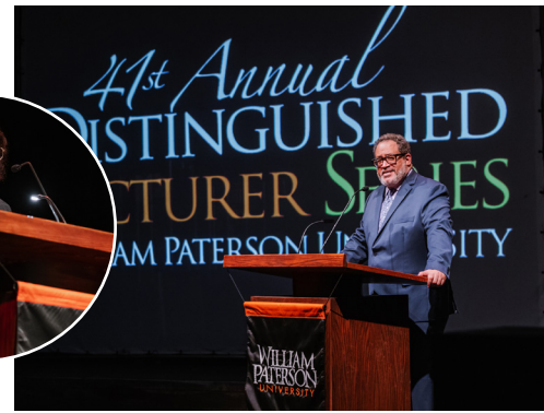
Michael Eric Dyson

The University continued to offer a wide range of music, art, and other cultural events for the community, including two speakers as part of the 41st season of the Distinguished Lecturer Series: best-selling author, academic, ordained minister, and radio host Michael Eric Dyson, one of the nation's foremost thinkers on race, who spoke on October 27, 2022, and author and cultural commentator Fran Lebowitz , who brought her trademark caustic wit and humorous New York sensibility to campus on February 22, 2023.