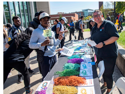
Wellness Days 2022

For the first time, on the recommendation of the Faculty Senate and the Student Government Association, two wellness days, October 13 and 14, were