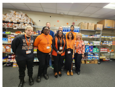
The expanded Pioneer Food Pantry

To increase support for students struggling with food insecurity, the Pioneer Pantry moved to a larger, more accessible space prior to the start of the fall 2023 semester. The new