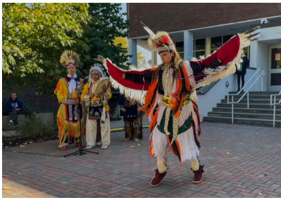
The Thunderbird American Indian Dancers

the Lenni Lenape people, was instituted for the fall 2022 semester. In addition, the second Monday of October was designated as “Indigenous People’s Day” at