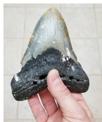
A Megalodon shark tooth