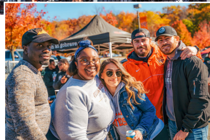
Homecoming and Family Day 2022

Fourteen hundred alumni, family, and friends returned to campus for Homecoming and Family Day on October 29, 2022. Events included a pre-game tailgate and a Pioneer Carnival. In addition, pre-game tailgates were held prior to each home game during the 2022 football season which drew alumni, families, faculty, staff, and community members.