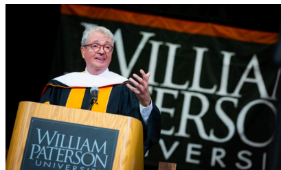
Gov. Murphy speaks at Undergraduate Commencement

Governor Murphy gave the keynote address and received an honorary doctor of humane letters degree at the 2023 Undergraduate