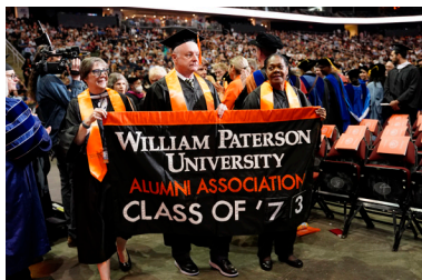
The Class of 1973 at Undergraduate Commencement

The Class of 1973 celebrated their 50 th reunion by participating in the Undergraduate Commencement ceremony on May 31 at the Prudential Center in Newark, along with a reunion luncheon and campus tour the following day. Forty-four members of the class joined the luncheon, 13 attended Commencement and 18 attended the campus tour. The Classes of 1970, 1971, and 1972 were inducted into the Pioneer Society, which recognizes and celebrates alumni who graduated 50 years ago or more.