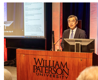
Consul General Huang Ping of the Chinese Consulate General

hosted by the University's Center for Chinese Art. The event featured academic presentations, discussions, and art exhibitions designed to offer a fresh look at the historical orientation of the Silk Road and the "Silk City" of Paterson.