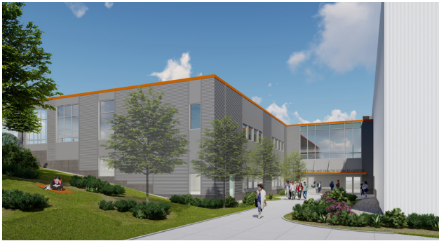
Another rendering of the Sports and Recreation Center expansion

triple the overall size of the building to accommodate a new Wellness Center and significant new classroom and lab space for Nursing, Kinesiology, and Exercise Science programs, in addition to a new fitness center, natatorium, and locker rooms. Existing space will be renovated to create a new training room and Sports Therapy and Rehabilitation Instructional Lab.