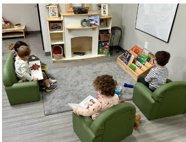
The Child Development Center

Another major facility, the Child Development Center, opened in the 1800 Valley Road Building on September 6, 2022. The CDC, which is designed to meet a well-documented need for childcare in Passaic County, is an important investment for the campus community and for the region. The 1800 Valley Road building also includes offices and classrooms for the School of Continuing and Professional Education, as well as