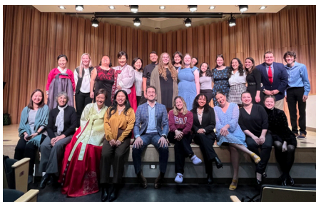
Voice students sing Korean language songs

The University continued to provide students with academic offerings that challenge them in the classroom and that provide them with opportunities to use the skills they have learned and apply them in real-world situations.