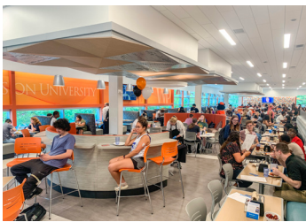
Wayne Dining Hall

operations to increase administrative efficiency, as well as provide better and more relevant real-time insights for business decisions. Funding of $639,000 for the project has been allocated by the State of New Jersey. A WP Workday Change Management Team is in place and working on the project, with cutover to the new system projected for January 1, 2024.