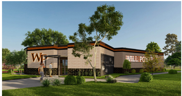
A rendering of the athletics fieldhouse renovation and expansion project

offices for the Office of Sponsored Programs, the Center for Degree Completion and Adult Learning, and the Office of Transfer Programs and Special Sessions.