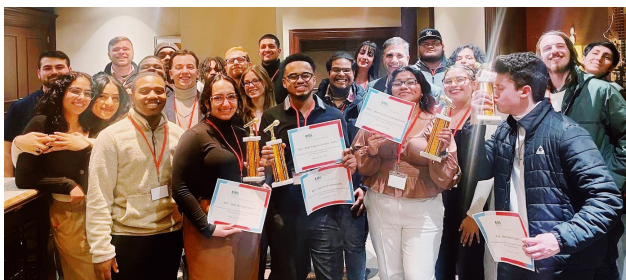
WPSC-FM students celebrate their awards

During the 2022-23 academic year, William Paterson provided opportunities for students to participate in undergraduate research and other scholarly and creative activities with faculty, as well as in a variety of civic, extracurricular, and athletic activities, earning honors and accolades.