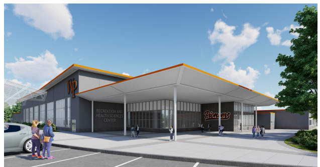
A rendering of the Sports and Recreation Center project

Construction will begin in fall 2023 on an addition and renovation of the athletics fieldhouse, an initiative designed to provide the institution's student-athletes with the resources they need to compete and succeed at the highest level. The project, slated for completion in August 2024, includes a 4,000-square-foot addition to the existing facility. It will include a student-athlete-specific fitness center, featuring strength training and cardio areas, with roll-up glass garage doors facing Wightman Stadium. It will also feature an expanded athletic training facility; individual locker rooms for field hockey, softball, and women's soccer; and a renovation of the existing football and baseball locker rooms. William Paterson fields 13 NCAA Division III intercollegiate teams and currently has 300 student-athletes.