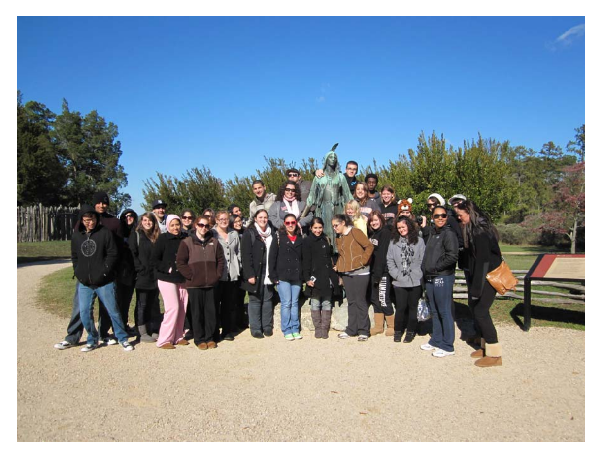
Honors students enjoy a field trip to Jamestown and Williamsburg, Virginia , November 2010