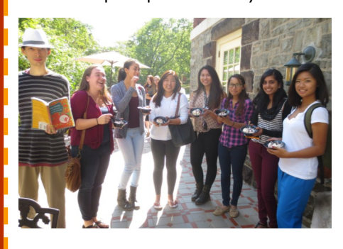
Honors students enjoying the ice cream social

The annual Honors Ice Cream Social was held on Wednesday, September 17. Those present had the opportunity to meet with their peers as well as University and Honors College faculty and staff. In addition to preparing sundaes, guests enjoyed participating in a photo scavenger hunt. The Honors College wishes to thank all those who participated in the day's festivities.