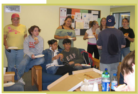
"Lunch in the Lounge"

Members of an Honors cluster meet in High Mountain East