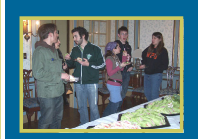
Reception following the Honors Performing and Literary Arts event