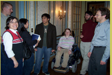
Honors students and faculty socialize at the annual Honors Holiday party